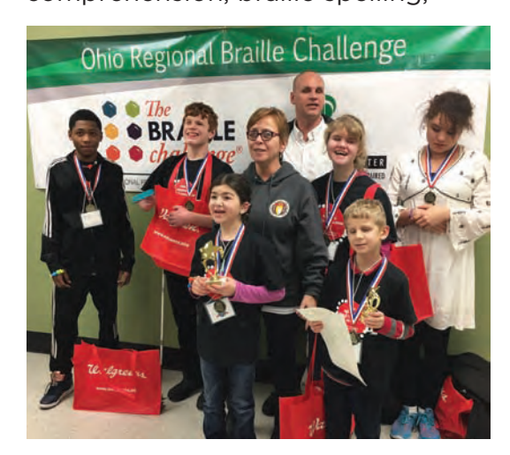
chart and graph reading, proof reading and braille speed and accuracy.

Clovernook Center for the Blind and Visually Impaired, in collaboration with the Braille Institute of America, hosted the first Regional Braille Challenge in the state of Ohio on Friday, March 3, 2017. Twenty-four students from across Ohio, competed to test their braille skills in five categories: Reading, comprehension, braille spelling,