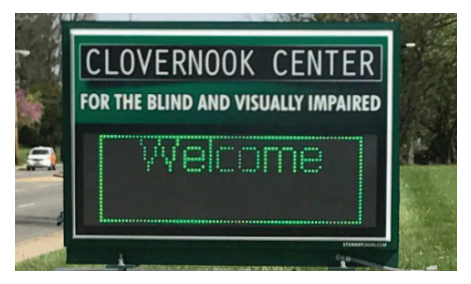
next time you drive by or visit our main campus!

This spring, Clovernook Center installed a new LED sign on its main campus. The new digital sign has been a great tool to communicate with the many individuals who travel Hamilton Avenue. Make sure to check it out